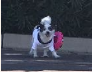
fierce Mini Barnes, Ole!