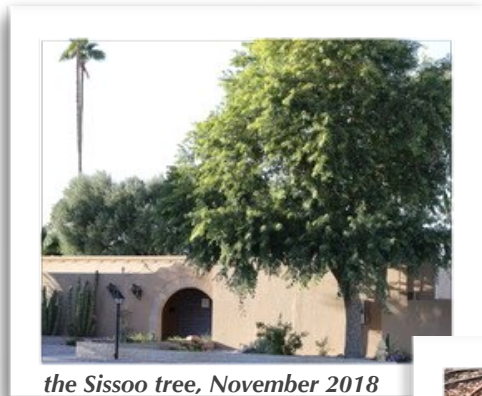
the Sissoo tree, November 2018

The Sissoo tree in front of the Ramada was removed this month. The board decided to remove the tree because of the invasive roots,which can grow 50 feet and are known to break walls, sidewalks, and foundations.The leaf droppings are also quite messy, cluttering the Ramada area and the nearby homes.